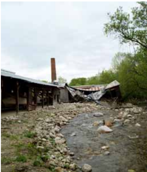
The former Vermont Tubbs furniture factory in Forestdale. The factory was destroyed when the Neshobe River escaped a berm on the left bank.

Berms like the one in Forestdale give communities a false sense of security. Prior to Irene, residents believed berms protected them from floodwaters. Yet berms often exacerbated Irene's flood damage. Once breached they trapped rivers on the populated side of the berm rather than keeping floodwaters away from property. In a few cases, communities learned from these failures and abandoned the berms, increasing a river's access to its floodplain. Unfortunately in other locations berms remain, increasing the risk of future floods to homes and property.