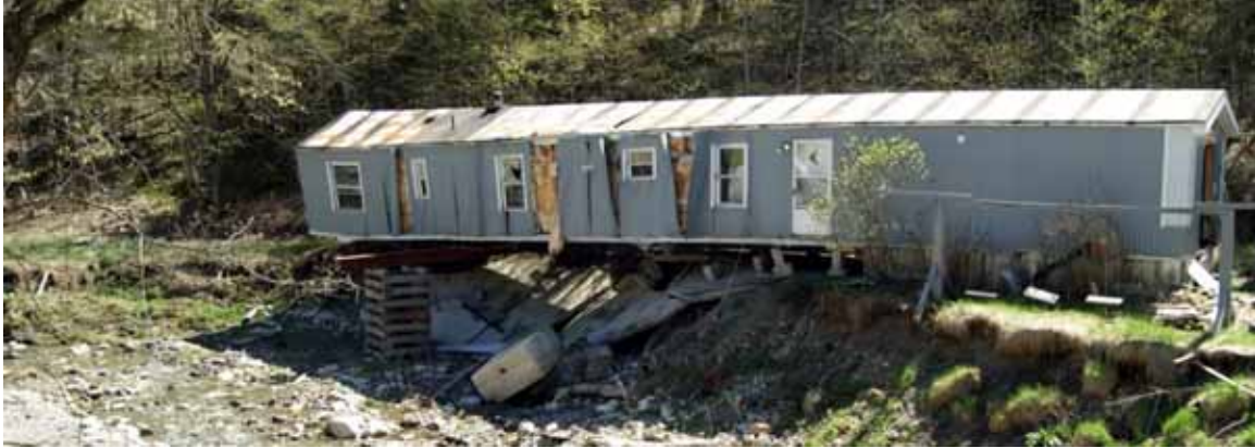
Structures built in floodplains like this one along the Danby-Pawlet Road are a risk for homeowners and the community at large. Floods can threaten to wash them downstream into bridges or other structures.

FEMA flood risk maps, upon which the NFIP program is based, have limitations. The maps are not flexible, especially in the face of the increased frequency and severity of storms that have been measured in the Northeast. The maps also do not account for watershed development that can increase surface runoff and the amount of water reaching a stream during a storm. FEMA floodplain maps do not include site-specific hazards like erosion and streambank failure from channel migration. Small feeder streams are typically omitted in such maps, but can be a significant source of local flooding. Channel debris can increase water levels above risk areas identified in flood maps. Rather than solely relying on standard FEMA maps, communities should consult with the Vermont Rivers Program and their local regional planning commission to address specific local conditions. The following steps will help any community prepare for floods (adapted from materials prepared by the Two Rivers Ottauquechee Regional Commission):