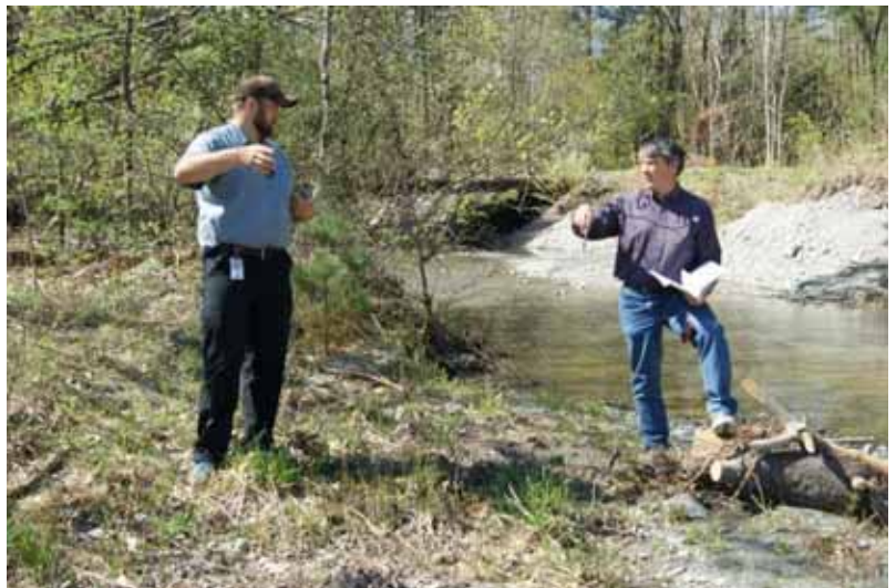
LCC thanks its partners for assistance and collaboration on "Lessons from the Floods."