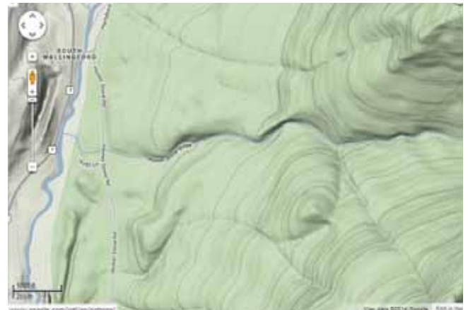
Homer Stone Brook drops over 1,200 feet between Little Rock Pond and the Otter Creek.

In East Middlebury the river also left its course, streaming down Route 125. Fortunately, damage was minor, even though there are nine houses located in known erosion hazard zone and eight in the 100-year floodplain. The state has been working with FEMA seeking federal funding approval for a hazard mitigation project to restore floodplain in this area.