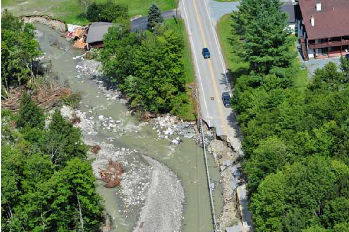
Irene left widespread destruction in its path, destroying roads and bridges like these along Route 100.