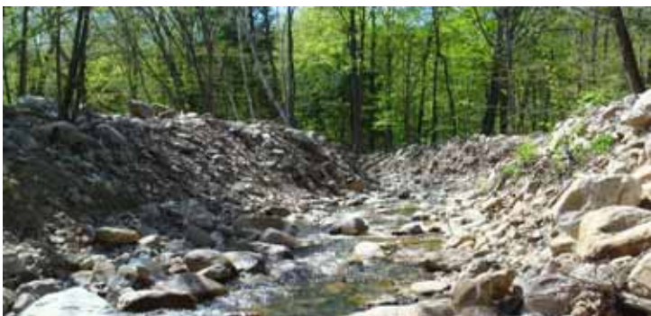
Berms along Homer Stone Brook gave local residents a sense they were safe from the water, but the brook escaped the berms during Irene.

Rivers naturally meander across valley bottoms, particularly as streams reach more level ground at the toe of mountain slopes, as in Forestdale, Wallingford and East Middlebury. When we place roads, railroad and homes in these locations, conflicts with rivers ensue. Berms to protect structures and roads offer false security. Berms can only temporarily constrain the river to a narrow channel in such locations. They are always at risk of failing in the next inevitable flood.