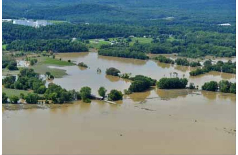
Flooded Otter Creek Wetlands in 2011.

Examples of stream alterations that increase vulnerability are common; examples of projects that minimize future flooding are not. Looking at instances of both 'good' and 'bad' examples of river corridor management can provide useful guidance. We spoke with regional planners and river engineers to identify projects. We then distilled these conversations into seven themes that provide lessons for municipal planners, road commissioners and others tasked with preparing for or responding to flooding disasters. With each lesson we present concrete examples of how it has played out in Vermont.