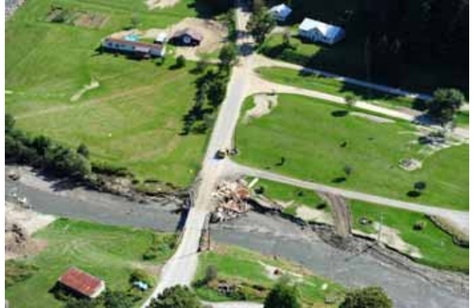
In Bridgewater Corners a house washed up against the bridge, blocking water and threatening to wipe out the bridge.

At one point during Irene, the Mill Brook House in Danby, once owned by the author Pearl S. Buck, collapsed into the adjacent river. The house was built somewhere between the early 1700 and 1800s according to unnamed town officials cited by the Manchester Journal. When it slipped into the water the Danby-Mt. Tabor Historical Society, which had purchased the house just 10 months earlier, lost its collection along with the building. Once in the river the Mill Brook House got caught against the Main Street Bridge, creating a dam. The river threatened to jump its channel, flow down Main Street and inundate homes in nearby low-lying areas. The bridge and an attached water main would have been lost. Fortunately, Thomas Fuller Jr., operating an excavator in the area, was alert to the potential danger. He acted quickly to smash the house, using the bucket of his machine to push through the roof and walls. The river then carried the debris underneath the bridge.