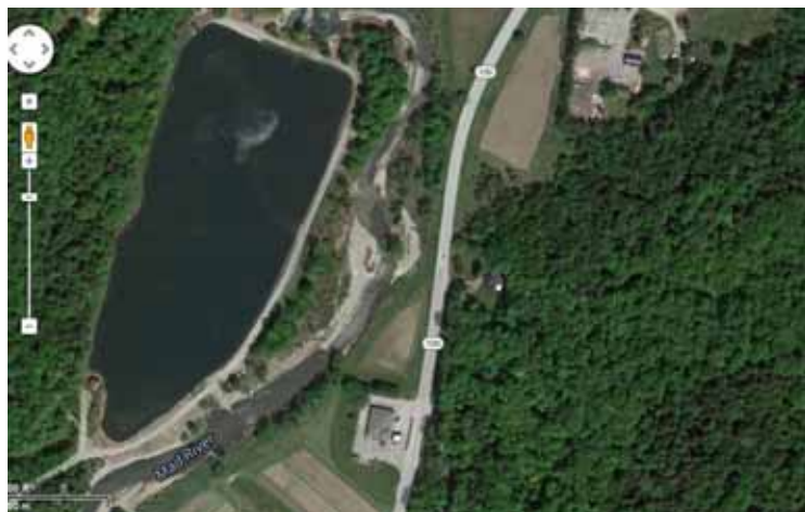
Sugarbush Ski Resort’s snow-making pond along Route 100 in Warren has been captured multiple times by the Mad River.

In 1995, Sugarbush Ski Resort built a new snow-making pond. Since then it has been captured by floods in 1995, 1998, 2001 and 2011. The 10-acre pond is adjacent to the Mad River mainstem, just downstream from Clay Brook. When it is breached, large sediment loads enter the river and move downstream so that deep pools downstream are almost entirely filled by loose unconsolidated sediment. During Irene, the pond collected tons of dirt and gravel.