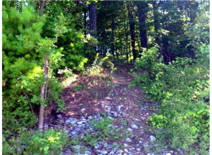
Failure to provide controlled access to the waterfront can lead to development of herd paths like this one. Once a herd path forms, erosion accelerates along it and it is extremely difficult to reestablish vegetation.

Lakeshore projects can have repercussions beyond just a single property. When waves come into shore at something other than a 90-degree angle, they bounce off walls, rocks and other hardened shoreline surfaces and impact the neighboring properties downwind, increasing erosion. Structures built too close to the lake can thus be destabilized by waves from the side. Walls can also cut off the supply of sand that feeds neighboring beaches. Waves that hit the shore on an oblique angle also create longshore currents which pick up sediment and carry it down shore. Over time the beaches that had developed down shore disappear once the source of the sediment is walled off. Whenever possible, erosion control projects should be coordinated with neighbors to avoid such impacts.