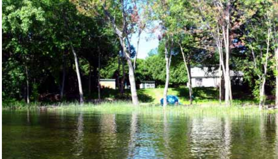
The trees in the foreground of this photo provide protection from wave action and lessen erosion along the lakeshore.

Natural shoreline vegetation also offers clear benefits to lake ecosystems. Bass preferentially build nests along undeveloped shorelines. Bass reach the legal size for fishing faster in undeveloped lakes. Trout get most of their food from terrestrial insects in undeveloped lakes, but at most two percent in lakes with extensive shoreline development. As a result, trout in undeveloped lakes ingest 50 percent more energy daily than those in developed lakes. Development decreases macroinvertebrate diversity in lakes leading to less and fewer types of food for fish. Cleared shorelines contribute 18 times more sediment, five times more runoff and seven times more phosphorus to the lake than those where the shoreline is wooded.