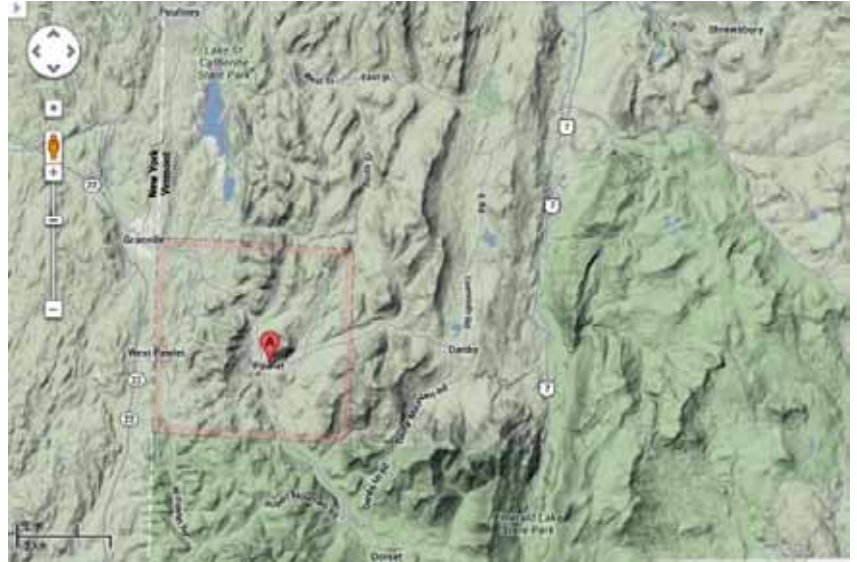
Despite two rivers and lots of mountains, Pawlet was well-prepared for Irene's wrath.

The Town of Warren also took steps prior to Irene to mitigate future floods. Warren was devastated by flooding in 1998 when heavy rains fell on already saturated soils in late June, swelling the Mad River. Following the flooding the town, with FEMA assistance, purchased three homes along the Mad River. Two of them later became the town-owned Riverside Park. Over the years gifts and additional purchases have helped the park expand. A 2008 plan for the park identified a primary goal of allowing the river channel to return to a balanced state. Over time, the river would top its banks and erode and deposit sediments along its channel and the park, which it did in 2011. According to Caitrin Maloney, formerly of Friends of the Mad River, Riverside Park area offers one of the first opportunities downstream from Warren Village, for “the river to blow off some steam” during high flow.