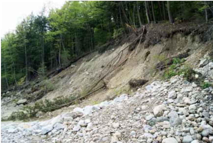
Landslide damage from Tropical Storm Irene along the Cold River.

Climate change models predict that our part of the country will become wetter still. Precipitation records for Burlington International Airport extend back to 1884. During that time, the amount of rainfall, measured on a rolling ten-year average, has steadily increased – we now get about five more inches of precipitation each year than we did at the end of the 19th century. It shouldn't be a surprise if we continue to see more floods in the years to come. We hope this document offers guidance and inspiration for community projects that increase our region's resilience to future floods.