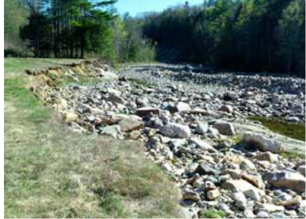
The Mill River (right) broke through its berm wiping out prime agricultural land at Evening Song Farm.

Other communities insist on rebuilding berms. Homer Stone Brook in Wallingford drops over 1,200 feet along its approximate two-mile length from its origins at Little Rock Pond on Green Mountain to its confluence with the Otter Creek. In the last one-sixth of that route, the brook's course flattens. Here berms were constructed to prevent the brook from fanning out to homes and railroad tracks that cross it downstream.