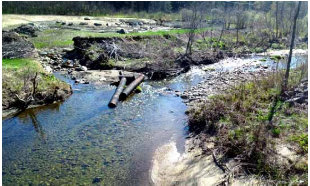
This Mt. Holly pond (top of photo) was constructed in the floodplain. During Irene the stream captured the pond releasing a surge of water and sediment downstream.