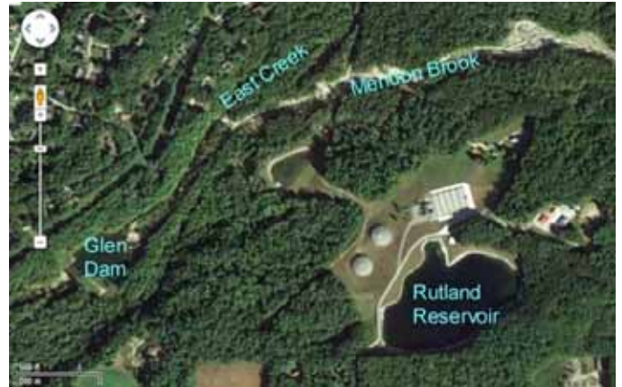
Emergency measures to protect the Rutland water supply led to later sediment build-up in Glen Dam, a hydropower source. Affected parties worked together to go back and correct the problems.

Raging floodwaters in Mendon Brook threatened the water supply system for Rutland during Irene. Water treatment plant supervisor Michael J. Garafano and his son Michael G. Garafano lost their lives when they went to check on the intake during the storm. The flood destroyed the water intake, plugging it with debris and rock, and forcing the utility to rely on a back-up on East Creek. At one point the city was down to a 13-day supply of water; its reservoir typically holds a 30-day supply. The backup system helped to refill the reservoir for a few days, but eventually the East Creek water levels dropped too low to be used. The city faced an emergency situation, and needed to reopen the Mendon Brook intake as quickly as possible.