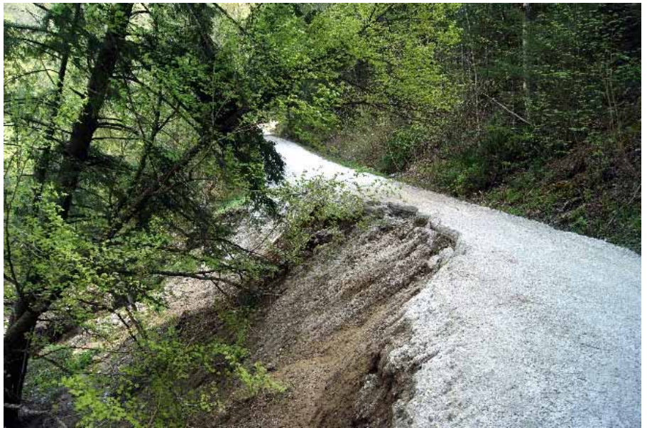
Upper Cold River Road in Shrewsbury washed away during Irene. Continued water seepage from the nearby hillside poses a significant construction challenge for this dirt road.

People – and communities – understandably develop emotional attachment to what they have built, nurtured and maintained over the years. Homes, buildings and infrastructure represent significant, hard to replace, financial investments. Yet, it's important to look ahead and take advantage of available opportunities to reduce flood vulnerability. In doing so, we minimize risks to life, property and community facilities. We need to change and evolve as a society and adapt to new circumstances.