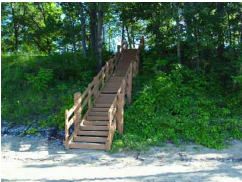
A designated staircase limits trampling of vegetation and preserves soil on slopes. Note too, gabions to left and right of staircase provide protection from erosion, but allow vegetation to grow through the wires.

Vulnerabilities are often inherent with the site. Pre-existing conditions such as erodible soils, or exposure to a wide stretch of lake over which winds can blow and waves can grow increase the likelihood a given site will have erosion problems. However, the management of the shoreline also matters. According to the Lake Champlain Basin Program's summary of the effects of the 2011 spring floods, "Shorelines with poor management, such as steep banks with little vegetation and lawns extending to the water's edge or shoreline immediately adjacent to seawalls were especially vulnerable to erosion."