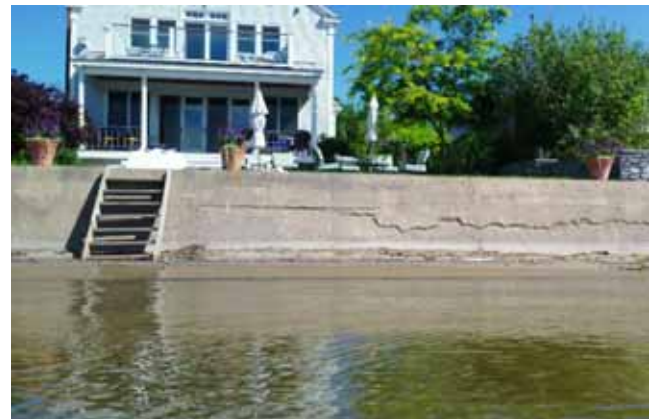
The push and pull of ground water from the landside plus waves from the lakeside, rock sea walls back and forth leading to cracks like this one. Cracks can be seen in scores of sea walls around the lake.

What went wrong? The wall was designed to dampen the force of lakeside waves, but the developers failed to account for the pressure of down-slope movement of land toward the lake. Erosion can be caused by water coming from the landside as well as lakeside waves. In this instance, the impervious surface created by buildings, parking areas and roads increased the amount of stormwater runoff flowing toward the lake.