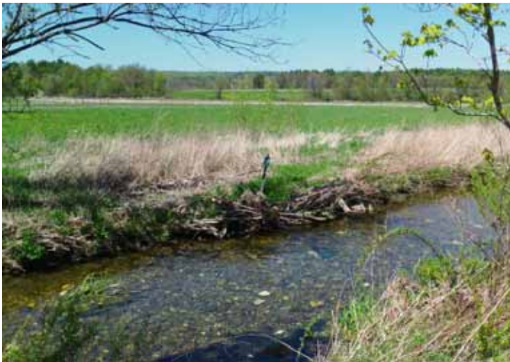
Berm removal allowed access to extensive floodplains (top of photo) along the Indian River in West Pawlet at the Consider Bardwell Farm.

The story of the Otter Creek in Rutland and Middlebury provides a stark reminder about the importance of wetlands and floodplain access to ameliorate flooding. Throughout our region wetlands have been lost to dredging, filling and development. Their loss exacerbates flood damage during Irene-like events. While the Otter Creek Wetlands are massive, there are many smaller places where floodplains could store more water. Restoring wetlands and increasing river access to floodplains will limit downstream flood damages.