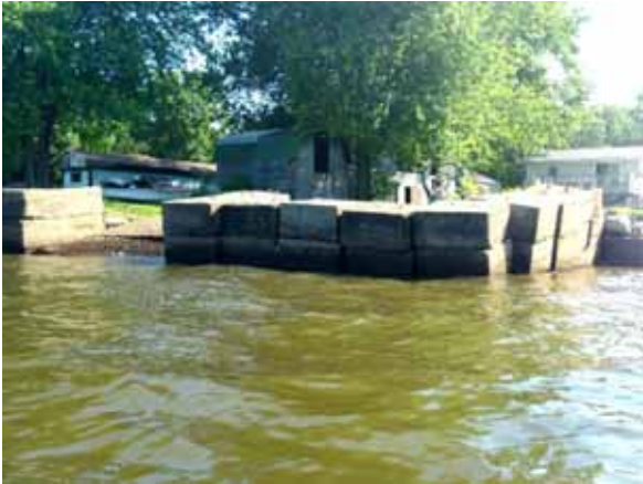
Poorly planned do-it-yourself projects like this one often lack structural integrity and soon fall apart.

Flooding impacts lakeshores in a different manner than it does riverbanks. Inundation is a more pressing problem than fluvial processes, though wind, waves, currents and ice also cause shoreline erosion. Property owners use a variety of methods to stabilize eroding shoreland. Poorly designed projects can be very expensive and unattractive, and harm the lake ecosystem, without even adequately protecting the shoreline.