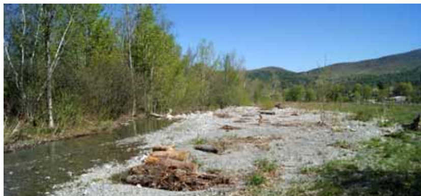
A berm along the right bank of Gully Brook (far left of photo) was removed prior to the storm providing the river additional flood storage capacity.

There are a myriad of ways – both good and bad – to control erosion along lakeshores. Not all are successful. A tour along Appletree Bay in Burlington provides some examples of projects that work and those that did not. Pre-planning and professional design help are key.