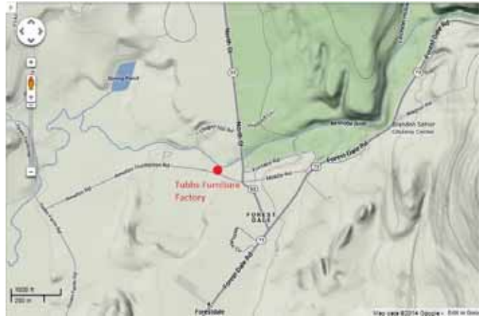
The Neshobe River flows from the west face of the Green Mountains before passing through Forestdale.

Where the river channel narrowed, Irene's waters crashed through the berm. Portions of the Vermont Tubbs furniture factory were destroyed. The river carved two-foot ditches on either side of Newton Road, and gouged channels through corn fields, tearing away topsoil and leaving only gravel deposits. Basements filled with river water.