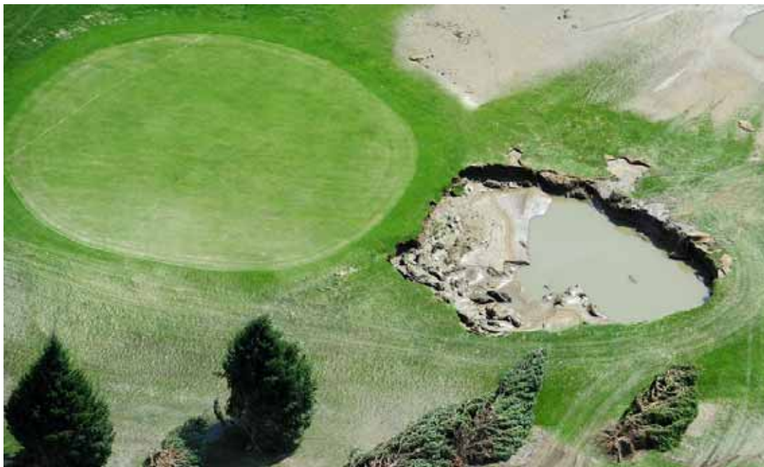
This sand trap on a central Vermont golf course was captured by the nearby river during Irene. Note the sand that has been delivered downstream at the top of the photo.

Ponds can be “captured” by flooding streams. Digging a hole next to a river leaves a depression lower than the river bed, and water will always seek the lowest point. During high water a river may flow into or capture an adjoining pond, and change its course. Over time, fine sediments accumulate in ponds. When ponds get captured by a flooding stream, those sediments wash out, accentuating any downstream debris jams. Gravel pits and golf course sand traps and water features are also susceptible. Care must be taken when planning, approving or constructing any depressions like ponds within a river corridor.