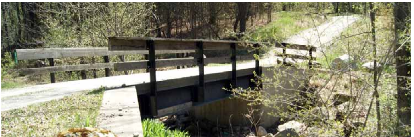
Of four stream crossings along North Road in Middletown Springs, this is the only one to have survived Irene. It was the only crossing built in consultation with a river scientist.

Road project designers would be well served to follow the examples of Clarence Decker, the town of Warren and the homeowners along North Road and consider future flooding during the planning stage. Many communities are already doing so. As one example, Bristol plans to replace two small undersized bridges on the New Haven River with a single 360-foot structure that will span the full flood-prone area. The new bridge will increase the capacity of the river to pass water and lessen the likelihood of future flood-related damage both to the bridge itself and downstream. Climatologists predict more intense storms and more flooding for our region. Adjusting our infrastructure to face this new reality will require foresight and preparation, but it is imperative that we do so.