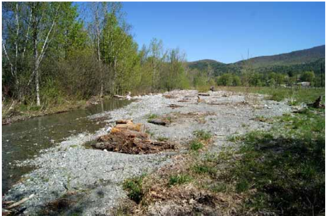
A berm along the right bank of Gully Brook (far left of photo) was removed prior to the storm providing the river additional flood storage capacity. The white rocks in this photo were deposited in the restored floodplain during Irene.

Examples like these inspired other communities not to rebuild berms destroyed following Irene. In Forestdale a berm washed out. The Neshobe River flooded basements, carved two-foot deep ditches along the road, and scoured farm fields. Rather than trying to recreate the berm, 14 acres of farmland were placed in river corridor easement, increasing the opportunities for the Neshobe to store water during subsequent floods. Freeman Brook in Mt. Holly wiped out portions of a berm along Freeman Brook Road. The town has opted not to rebuild so this stream will also have access to additional floodplain storage during future storms.