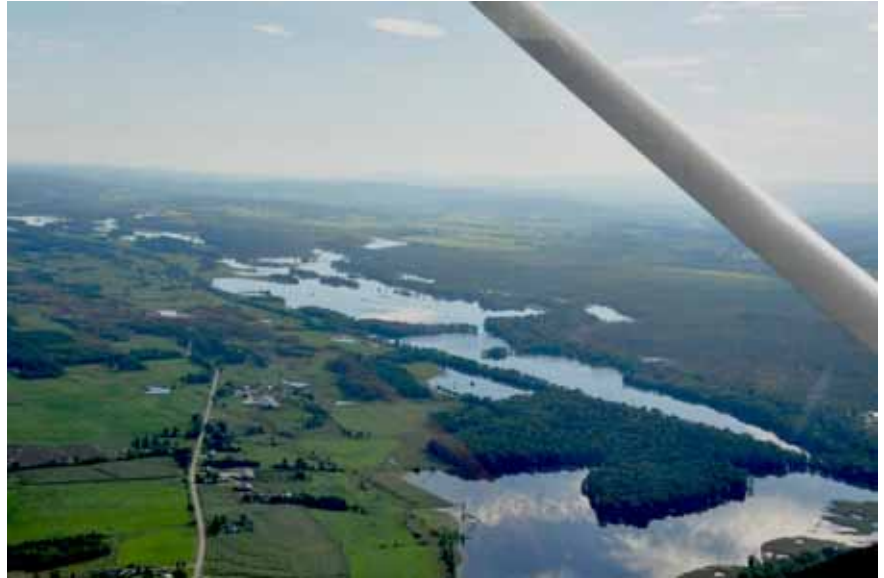
A vast complex of wetlands sits along the Otter Creek between Rutland and Middlebury. The wetlands protected downstream communities by soaking up immense amounts of water during Irene.

During Irene, the Otter Creek in Rutland swelled reaching a peak discharge of 15,700 cubic feet of water per second (cfs) and flood waters caused tremendous damage. Thirty miles downstream Middlebury is situated on the Otter Creek, but conditions there were quite different. The maximum peak discharge was only 6,180 cfs. Within four days the storm flow in Rutland had returned to normal, but in Middlebury flows did not even peak until then. Middlebury flows remained high for another two weeks and there was no flood damage! The dramatic differences in the Otter Creek at these two points can be explained by the presence of a vast, 9,000-acre complex of wetlands, in the floodplain of the Otter Creek between Middlebury and Rutland. The wetlands stored flood waters, slowly releasing them over time so that Middlebury and points downstream never experienced the full force of the flood. Businesses remained open and life went on as usual.