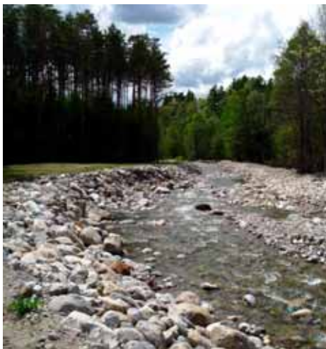
The Mendon Brook near the Rutland water intake jumped the left bank near this spot threatening the intake.

Glen Dam sits just downstream of the confluence of Mendon Brook and East Creek. It was owned and managed by Central Vermont Public Service (CVPS – now Green Mountain Power). From Glen Dam water passes via a penstock to the 2,000-kilowatt Glen Station on the western side of Route 7 in Rutland Town, generating power. Excess accumulation of sediment in the impoundment threatened future power generating ability.