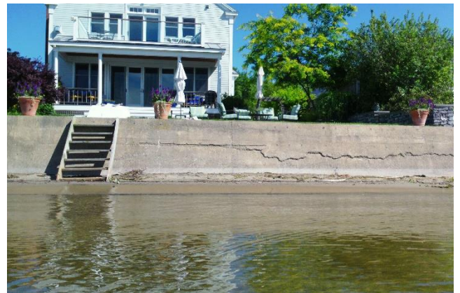
The push and pull of ground water from the landside plus waves from the lakeside rock sea walls back and forth leading to cracks like this one. Cracks can be seen in scores of sea walls around the lake.

Controlling shoreline erosion is complicated. All the forces acting on a particular site need to be considered. A project that fails leads to loss of money, loss of land and ecological damage. Shoreline erosion control projects should not be undertaken lightly and land owners would be wise to consult with professional engineers before proceeding. The do-it-yourself project is the one most likely to require rebuilding in just a few years.