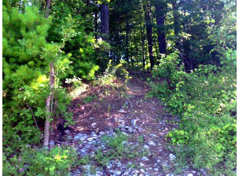
Failure to provide controlled access to the waterfront can lead to development of herd paths like this one. Once a herd path forms, erosion accelerates along it and it is extremely difficult to reestablish vegetation.

Lakeshore projects can have repercussions beyond just a single property. When waves come into shore at something other than a 90-degree angle, they bounce off walls, rocks and other hardened shoreline surfaces and impact the neighboring properties downwind, increasing erosion. Structures built too close to the lake can thus be destabilized by waves from the side. Walls can also cut off the supply of sand that feeds neighboring beaches. Waves that hit the shore on an oblique angle also create longshore currents which pick up sediment and carry it down shore. Over time the beaches that had developed down shore disappear once the source of the sediment is walled off. Whenever possible, erosion control projects should be coordinated with neighbors to avoid such impacts.