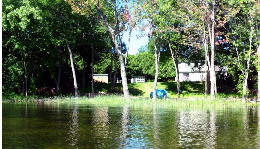
The trees in the foreground of this photo provide protection from wave action and lessen erosion along the lakeshore.

Natural shoreline vegetation also offers clear benefits to lake ecosystems. Bass preferentially build nests along undeveloped shorelines. Bass reach the legal size for fishing faster in undeveloped lakes. Trout get most of their food from terrestrial insects in undeveloped lakes, but at most two percent in lakes with extensive shoreline development. As a result, trout in undeveloped lakes ingest 50 percent more energy daily than those in developed lakes. Development decreases macro-invertebrate diversity in lakes leading to less and fewer types of food for fish. Cleared shorelines contribute 18 times more sediment, five times more runoff and seven times more phosphorus to the lake than those where the shoreline is wooded.