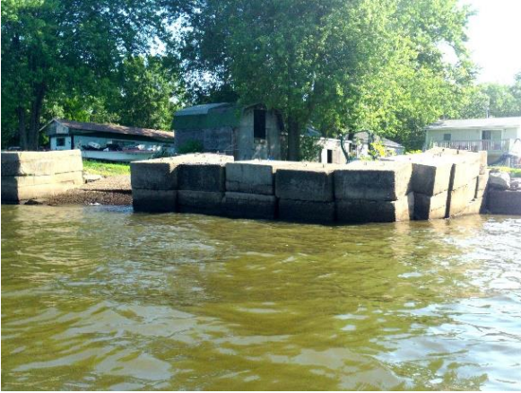
Poorly planned do-it-yourself projects like this one often lack structural integrity and soon fall apart.

Flooding impacts lakeshores in a different manner than it does riverbanks. Inundation is a more pressing problem than fluvial processes, though wind, waves, currents and ice also cause shoreline erosion. Property owners use a variety of methods to stabilize eroding shoreland. Poorly designed projects can be very expensive and unattractive, and harm the lake ecosystem, without even adequately protecting the shoreline.