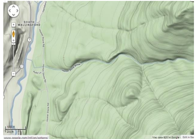
Homer Stone Brook drops over 1,200 feet between Little Rock Pond and the Otter Creek.

Like the Mill River, Homer Stone Brook escaped from its berms during Irene, carving a new route to the Otter Creek. Once outside the berm, the river could no longer access its old channel. The new channel paralleled the railroad tracks for a few hundred feet before cutting underneath them to a new outlet. The railroad incurred hundreds of thousands of dollars in damage as a result. Despite this failure, the berms were reconstructed and heightened after the storm, and the river channel was narrowed even more.