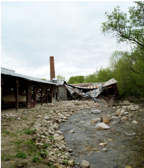
The former Vermont Tubbs furniture factory in Forestdale. The factory was destroyed when the Neshobe River escaped a berm on the left bank.

Berms like the one in Forestdale give communities a false sense of security. Prior to Irene, residents believed berms protected them from floodwaters. Yet berms often exacerbated Irene's flood damage. Once breached they trapped rivers on the populated side of the berm rather than keeping floodwaters away from property. In a few cases, communities learned from these failures and abandoned the berms, increasing a river's access to its floodplain. Unfortunately in other locations berms remain, increasing the risk of future floods to homes and property.