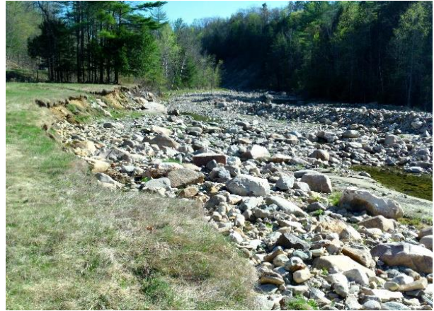
The Mill River (right) broke through its berm wiping out prime agricultural land at Evening Song Farm.

Other communities insist on rebuilding berms. Homer Stone Brook in Wallingford drops over 1,200 feet along its approximate two-mile length from its origins at Little Rock Pond on Green Mountain to its confluence with the Otter Creek. In the last one-sixth of that route, the brook's course flattens. Here berms were constructed to prevent the brook from fanning out to homes and railroad tracks that cross it downstream.