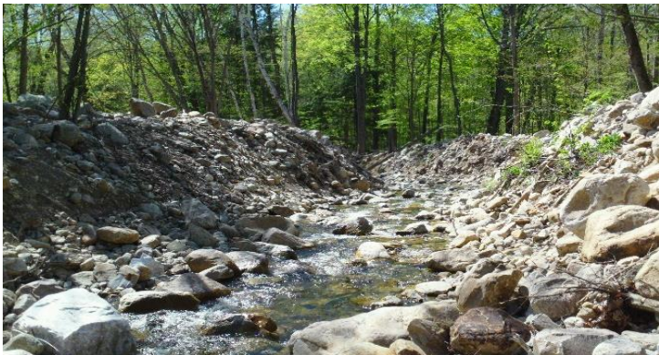
Berms along Homer Stone Brook gave local residents a sense they were safe from the water, but the brook escaped the berms during Irene.

Wallingford and East Middlebury. When we place roads, railroad and homes in these locations, conflicts with rivers ensue. Berms to protect structures and roads offer false security. Berms can only temporarily constrain the river to a narrow channel in such locations. They are always at risk of failing in the next inevitable flood.