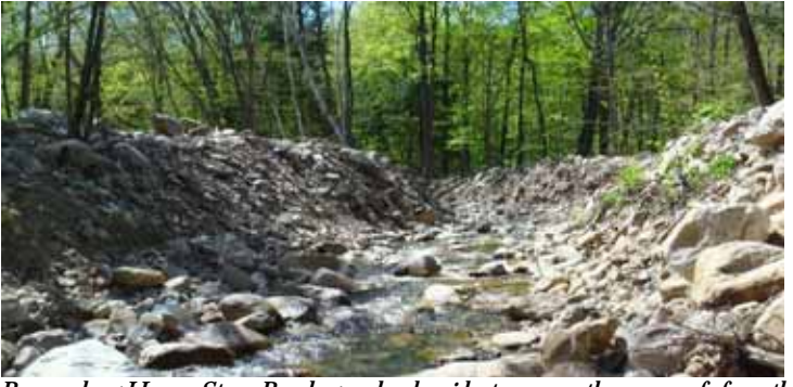
Berms along Homer Stone Brook gave local residents a sense they were safe from the water, but the brook escaped the berms during Irene.

Rivers naturally meander across valley bottoms, particularly as streams reach more level ground at the toe of mountain slopes, as in Forestdale, Wallingford and East Middlebury. When we place roads, railroad and homes in these locations, conflicts with rivers ensue. Berms to protect structures and roads offer false security. Berms can only temporarily constrain the river to a narrow channel in such locations. They are always at risk of failing in the next inevitable flood.