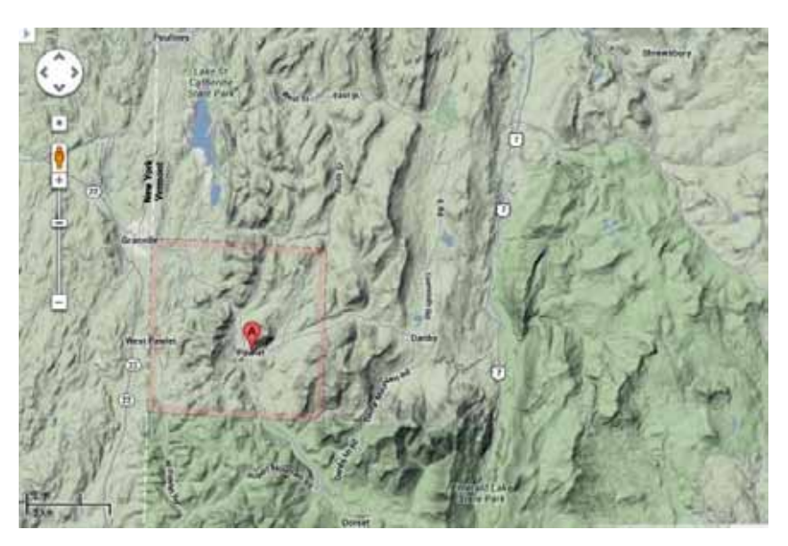
Despite two rivers and lots of mountains, Pawlet was well-prepared for Irene's wrath.

The Town of Warren also took steps prior to Irene to mitigate future floods. Warren was devastated by flooding in 1998 when heavy rains fell on already saturated soils in late June, swelling the Mad River. Following the flooding the town, with FEMA assistance, purchased three homes along the Mad River. Two of them later became the town-owned Riverside Park. Over the years gifts and additional purchases have helped the park expand. A 2008 plan for the park identified a primary goal of allowing the river channel to return to a balanced state. Over time, the river would top its banks and erode and deposit sediments along its channel and the park, which it did in 2011. According to Caitrin Maloney, formerly of Friends of the Mad River, Riverside Park area offers one of the