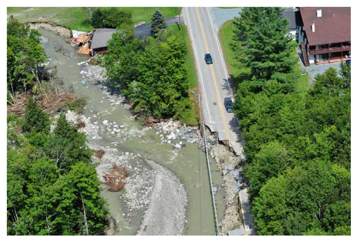
Irene left widespread destruction in its path, destroying roads and bridges like these along Route 100.