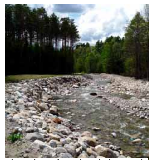
The Mendon Brook near the Rutland water intake jumped the left bank near this spot threatening the intake.

of sediment in the impoundment threatened future power generating ability.