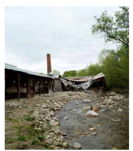
The former Vermont Tubbs furniture factory in Forestdale. The factory was destroyed when the Neshobe River escaped a berm on the left bank.

Berms like the one in Forestdale give communities a false sense of security. Prior to Irene, residents believed berms protected them from floodwaters. Yet berms often exacerbated Irene's flood damage. Once breached they trapped rivers on the populated side of the berm rather than keeping floodwaters away from property. In a few cases, communities learned from these failures and abandoned the berms, increasing a river's access to its floodplain. Unfortunately in other locations berms remain, increasing the risk of future floods to homes and property.