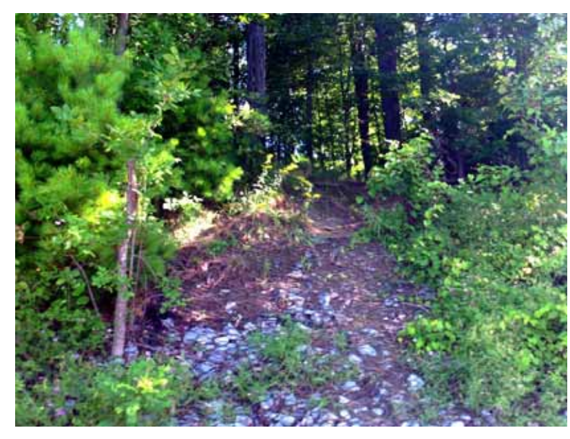
Failure to provide controlled access to the waterfront can lead to development of herd paths like this one. Once a herd path forms, erosion accelerates along it and it is extremely difficult to reestablish vegetation.

Lakeshore projects can have repercussions beyond just a single property. When waves come into shore at something other than a 90-degree angle, they bounce off walls, rocks and other hardened shoreline surfaces and impact the neighboring