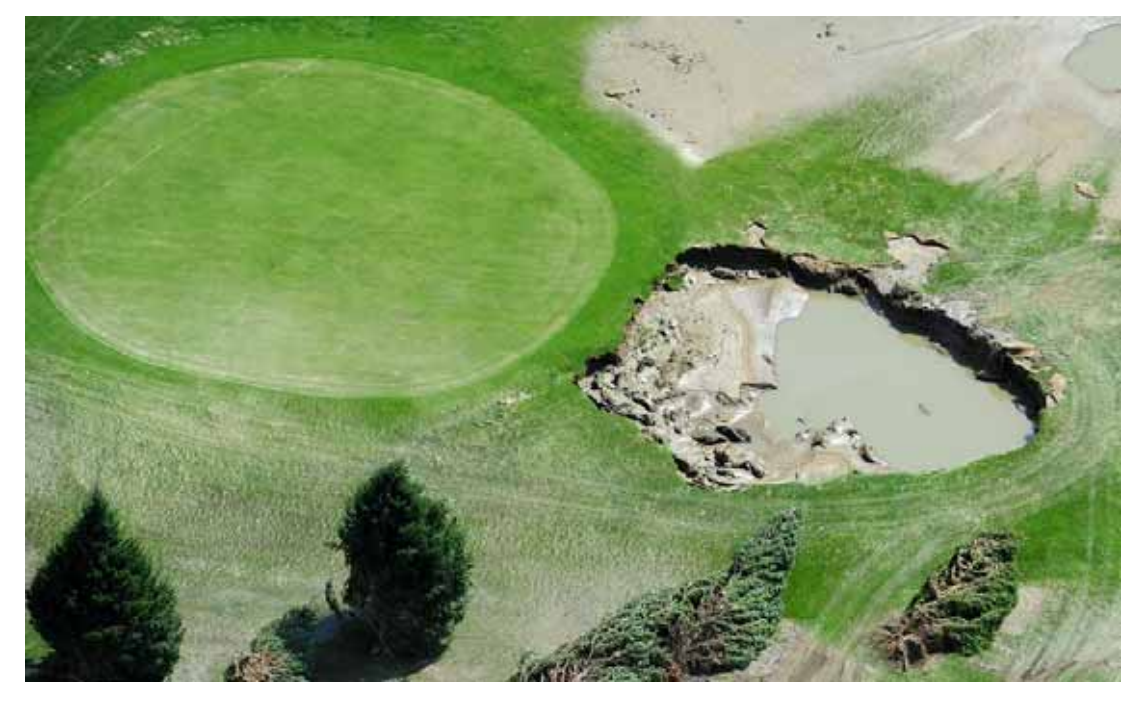
This sand trap on a central Vermont golf course was captured by the nearby river during Irene. Note the sand that has been delivered downstream at the top of the photo.

Ponds can be "captured" by flooding streams. Digging a hole next to a river leaves a depression lower than the river bed, and water will always seek the lowest point. During high water a river may flow into or capture an adjoining pond, and change its course. Over time, fine sediments accumulate in ponds. When ponds get captured by a flooding stream, those sediments wash out, accentuating any downstream debris jams. Gravel pits and golf course sand traps and water features are also susceptible. Care must be taken when planning, approving or constructing any depressions like ponds within a river corridor.