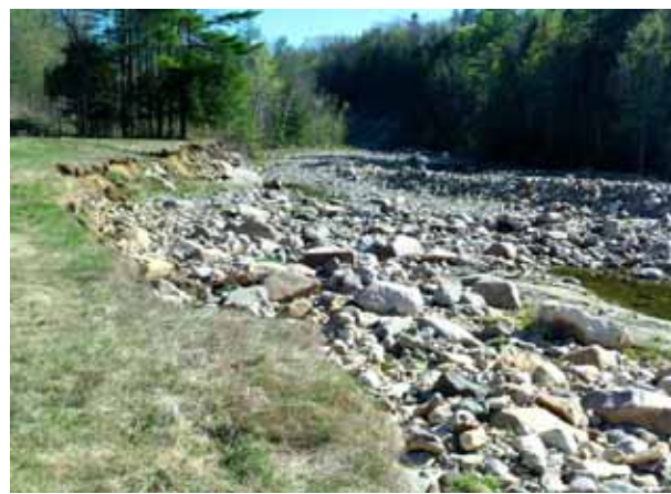
The Mill River (right) broke through its berm wiping out prime agricultural land at Evening Song Farm.

Other communities insist on rebuilding berms. Homer Stone Brook in Wallingford drops over 1,200 feet along its approximate two-mile length from its origins at Little Rock Pond on Green Mountain to its confluence with the Otter Creek. In the last one-sixth of that route, the brook's course flattens. Here berms were constructed to prevent the brook from fanning out to homes and railroad tracks that cross it downstream.