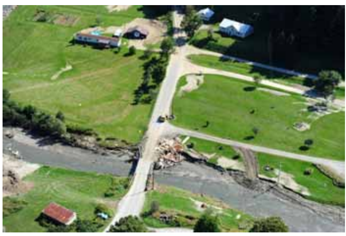
In Bridgewater Corners a house washed up against the bridge, blocking water and threatening to wipe out the bridge.

At one point during Irene, the Mill Brook House in Danby, once owned by the author Pearl S. Buck, collapsed into the adjacent river. The house was built somewhere between the early 1700 and 1800s according to unnamed town officials cited by the Manchester Journal. When it slipped into the water the Danby-Mt. Tabor Historical Society, which had purchased the house just 10 months earlier, lost its