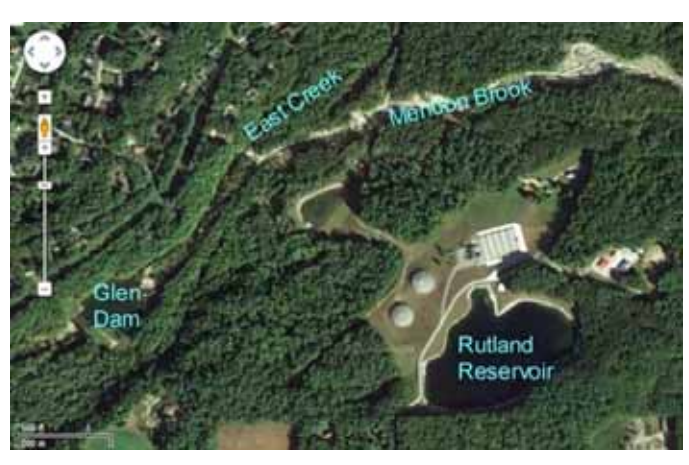
Emergency measures to protect the Rutland water supply led to later sediment build-up in Glen Dam, a hydropower source. Affected parties worked together to go back and correct the problems.

Raging floodwaters in Mendon Brook threatened the water supply system for Rutland during Irene. Water treatment plant supervisor Michael J. Garafano and his son Michael G. Garafano lost their lives when they went to check on the intake during the storm. The flood destroyed the water intake, plugging it with debris and rock, and forcing the utility to rely on a back-up on East Creek. At one point the city was down to a 13-day supply of water; its reservoir typically holds a 30-day supply. The backup system helped to refill the reservoir for a few days, but eventually the East Creek water levels dropped too low to be used. The city faced an emergency situation, and needed to reopen the Mendon Brook intake as quickly as possible.