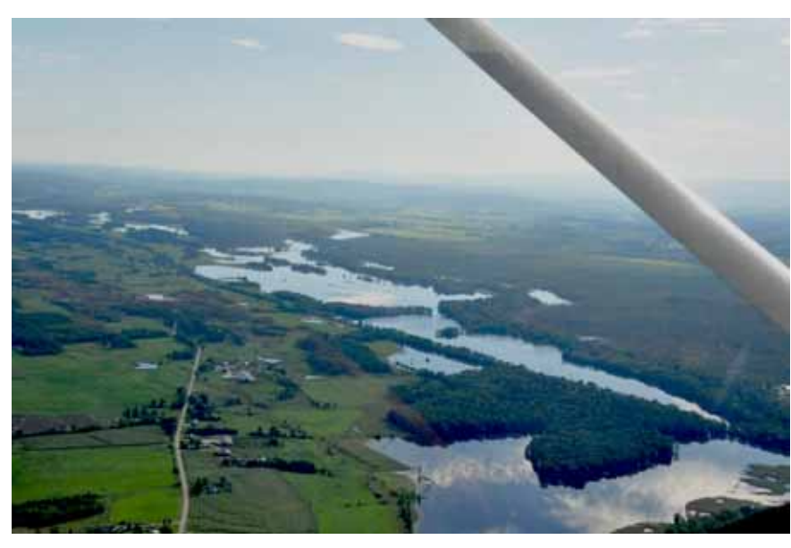
A vast complex of wetlands sits along the Otter Creek between Rutland and Middlebury. The wetlands protected downstream communities by soaking up immense amounts of water during Irene.

uring Irene, the Otter Creek in Rutland swelled reaching a peak discharge of 15,700 cubic feet of water per second (cfs) and flood waters caused tremendous damage. Thirty miles downstream Middlebury is situated on the Otter Creek, but conditions there were quite different. The maximum peak discharge was only 6,180 cfs. Within four days the storm flow in Rutland had returned to normal, but in Middlebury flows did not even peak until then. Middlebury flows remained high for another two weeks and there was no flood damage! The dramatic differences in the Otter Creek at these two points can be explained by the presence of a vast, 9,000-acre complex of wetlands, in the floodplain of the Otter Creek between Middlebury and Rutland. The wetlands stored flood waters, slowly releasing them over time so that Middlebury and points downstream