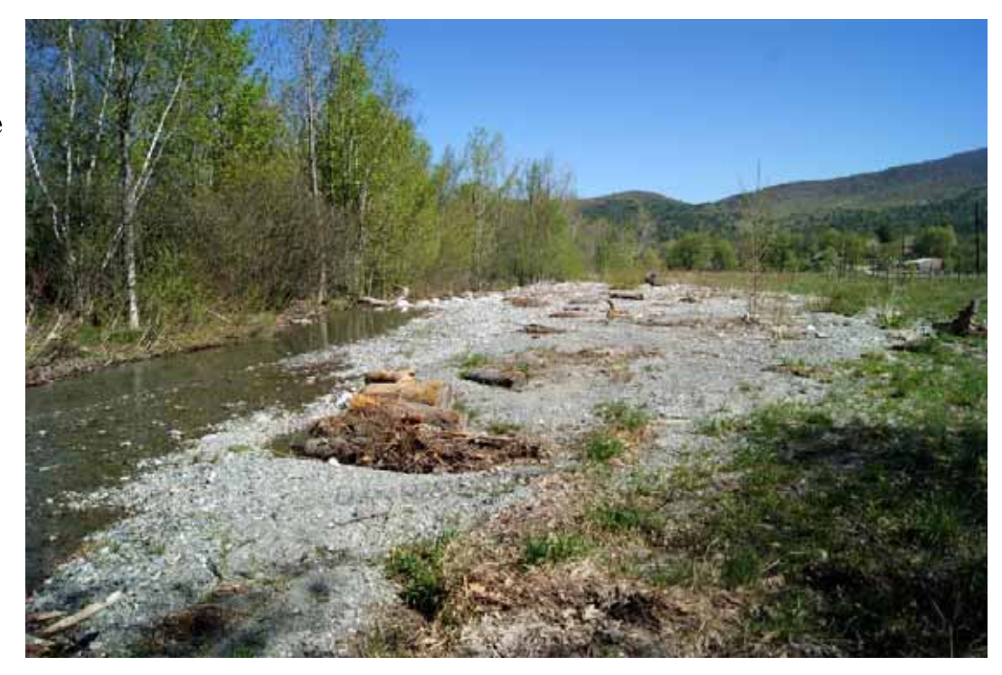
A berm along the right bank of Gully Brook (far left of photo) was removed prior to the storm providing the river additional flood storage capacity. The white rocks in this photo were deposited in the restored floodplain during Irene.

Examples like these inspired other communities not to rebuild berms destroyed following Irene. In Forestdale a berm washed out. The Neshobe River flooded basements, carved two-foot deep ditches along the road, and scoured farm fields. Rather than trying to recreate the berm, 14 acres of farmland were placed in river corridor easement, increasing the opportunities for the Neshobe to store water during subsequent floods. Freeman Brook in Mt. Holly wiped out portions of a berm along Freeman Brook Road. The town has opted not to rebuild so this stream will also have access to additional floodplain storage during future storms.