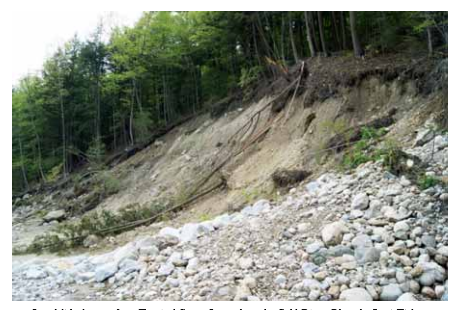
Landslide damage from Tropical Storm Irene along the Cold River.

Climate change models predict that our part of the country will become wetter still. Precipitation records for Burlington International Airport extend back to 1884. During that time, the amount of rainfall, measured on a rolling ten-year average, has steadily increased – we now get about five more inches of precipitation each year than we did at the end of the 19th century. It shouldn't be a surprise if we continue to see more floods in the years to come. We hope this document offers guidance and inspiration for community projects that increase our region's resilience to future floods.