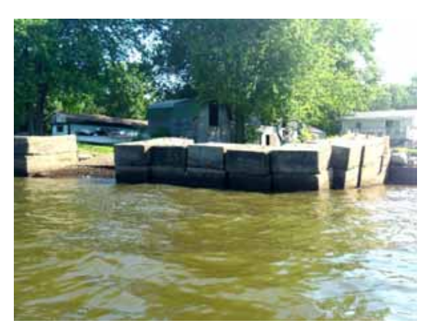
Poorly planned do-it-yourself projects like this one often lack structural integrity and soon fall apart.

Plooding impacts lakeshores in a different manner than it does riverbanks. Inundation is a more pressing problem than fluvial processes, though wind, waves, currents and ice also cause shoreline erosion. Property owners use a variety of methods to stabilize eroding shoreland. Poorly designed projects can be very expensive and unattractive, and harm the lake ecosystem, without even adequately protecting the shoreline.