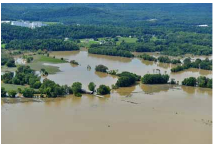
Flooded Otter Creek Wetlands in 2011.

These lessons are not meant to provide a comprehensive understanding of river geomorphology. There are many useful guides