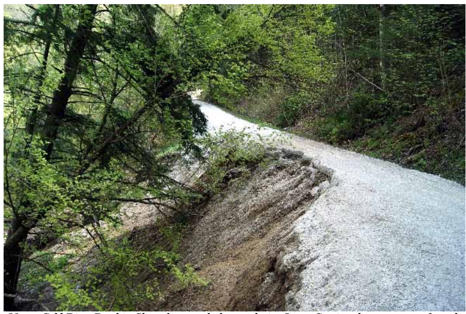
Upper Cold River Road in Shrewsbury washed away during Irene. Continued water seepage from the nearby hillside poses a significant construction challenge for this dirt road.

West River Road parallels the New Haven River and connects Lincoln and Bristol. It is the main route out of Lincoln. Flooding in 1998 washed out portions of the road and isolated Lincoln, and flood damage along the road still occurs on a regular basis. Lincoln has adopted a River Overlay Area in its zoning regulations to prevent floodplain development, but the overlay