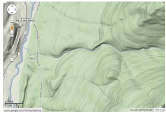
Homer Stone Brook drops over 1,200 feet between Little Rock Pond and the Otter Creek.

In East Middlebury the river also left its course, streaming down Route 125. Fortunately, damage was minor, even though there are nine houses located in known erosion hazard zone and eight in the 100-year floodplain. The state has been working with FEMA seeking federal funding approval for a hazard mitigation project to restore floodplain in this area.