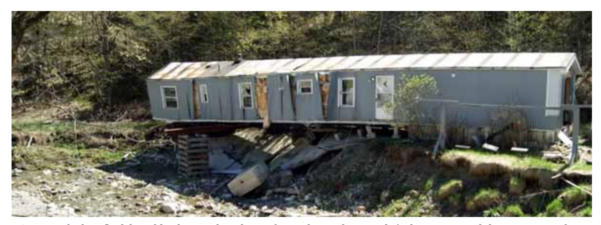
Structures built in floodplains like this one along the Danby-Pawlet Road are a risk for homeowners and the community at large. Floods can threaten to wash them downstream into bridges or other structures.

FEMA flood risk maps, upon which the NFIP program is based, have limitations. The maps are not flexible, especially in the face of the increased frequency and severity of storms that have been measured in the Northeast. The maps also do not account for watershed development that can increase surface runoff and the amount of water reaching a stream during a storm. FEMA floodplain maps do not include site-specific hazards like erosion and streambank failure from channel migration. Small feeder streams are typically omitted in such maps, but can be a significant source of local flooding. Channel debris can increase water levels above risk areas identified in flood maps. Rather than solely relying on standard FEMA maps, communities should consult with the Vermont Rivers Program and their local regional planning commission to address specific local conditions. The following steps will help any community prepare for floods (adapted from materials prepared by the Two Rivers Ottauquechee Regional Commission):