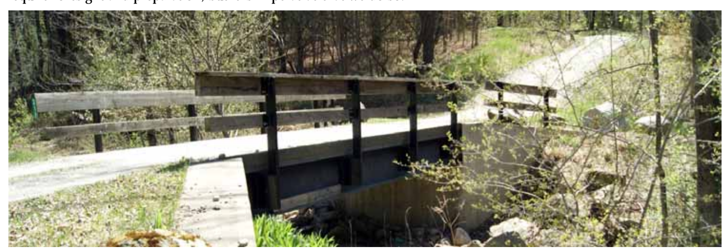
Of four stream crossings along North Road in Middletown Springs, this is the only one to have survived Irene. It was the only crossing built in consultation with a river scientist.

Road project designers would be well served to follow the examples of Clarence Decker, the town of Warren and the homeowners along North Road and consider future flooding during the planning stage. Many communities are already doing so. As one example, Bristol plans to replace two small undersized bridges on the New Haven River with a single 360-foot structure that will span the full flood-prone area. The new bridge will increase the capacity of the river to pass water and lessen the likelihood of future flood-related damage both to the bridge itself and downstream. Climatologists predict more intense storms and more flooding for our region. Adjusting our infrastructure to face this new reality will require foresight and preparation, but it is imperative that we do so.