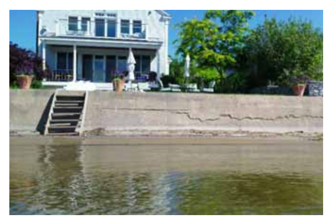
The push and pull of ground water from the landside plus waves from the lakeside, rock sea walls back and forth leading to cracks like this one. Cracks can be seen in scores of sea walls around the lake.

Controlling shoreline erosion is complicated. All the forces acting on a particular site need to be considered. A project that fails leads to loss of money, loss of land and ecological damage. Shoreline erosion control projects should not be undertaken lightly and land owners would be wise to consult with professional engineers before proceeding. The do-it-yourself project is the one most likely to require rebuilding in just a few years.