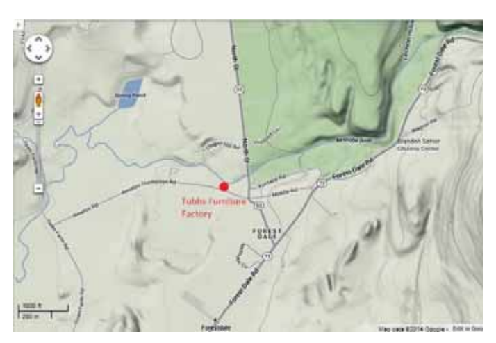
The Neshobe River flows from the west face of the Green Mountains before passing through Forestdale.

Where the river channel narrowed, Irene's waters crashed through the berm. Portions of the Vermont Tubbs furniture factory were destroyed. The river carved two-foot ditches on either side of Newton Road, and gouged channels through corn fields, tearing away topsoil and leaving only gravel deposits. Basements filled with river water.