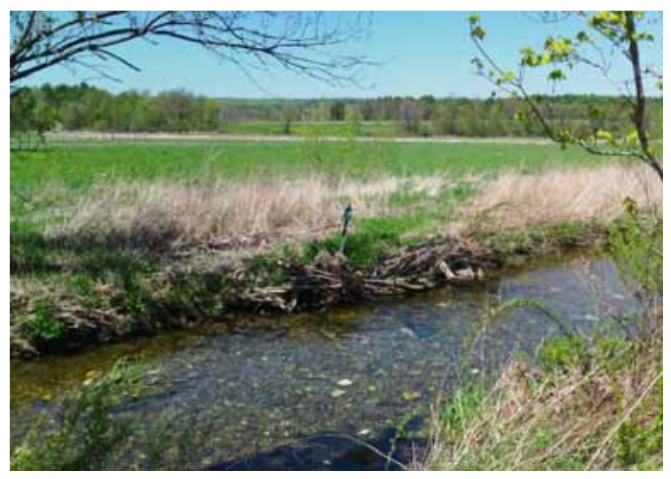
Berm removal allowed access to extensive floodplains (top of photo) along the Indian River in West Pawlet at the Consider Bardwell Farm.

The story of the Otter Creek in Rutland and Middlebury provides a stark reminder about the importance of wetlands and floodplain access to ameliorate flooding. Throughout our region wetlands have been lost to dredging, filling and development. Their loss exacerbates flood damage during Irene-like events. While the Otter Creek Wetlands are massive, there are many smaller places where floodplains could store more water. Restoring wetlands and increasing river access to floodplains will limit downstream flood damages.