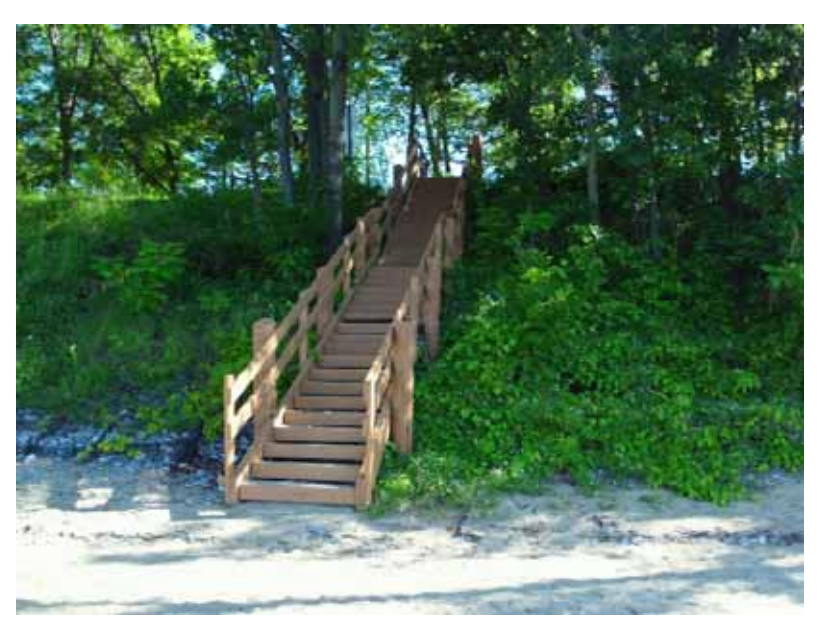
A designated staircase limits trampling of vegetation and preserves soil on slopes. Note too, gabions to left and right of staircase provide protection from erosion, but allow vegetation to grow through the wires.

properties downwind, increasing erosion. Structures built too close to the lake can thus be destabilized by waves from the side. Walls can also cut off the supply of sand that feeds neighboring beaches. Waves that hit the shore on an oblique angle also create longshore currents which pick up sediment and carry it down shore. Over time the beaches that had developed down shore disappear once the source of the sediment is walled off. Whenever possible, erosion control projects should be coordinated with neighbors to avoid such impacts.