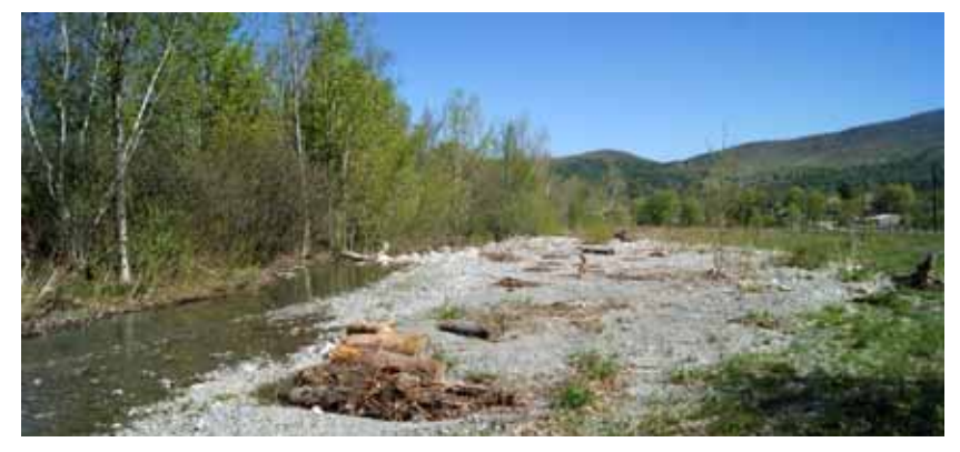
A berm along the right bank of Gully Brook (far left of photo) was removed prior to the storm providing the river additional flood storage capacity.

There are a myriad of ways – both good and bad – to control erosion along lakeshores. Not all are successful. A tour along Appletree Bay in Burlington provides some examples of projects that work and those that did not. Pre-planning and professional design help are key.