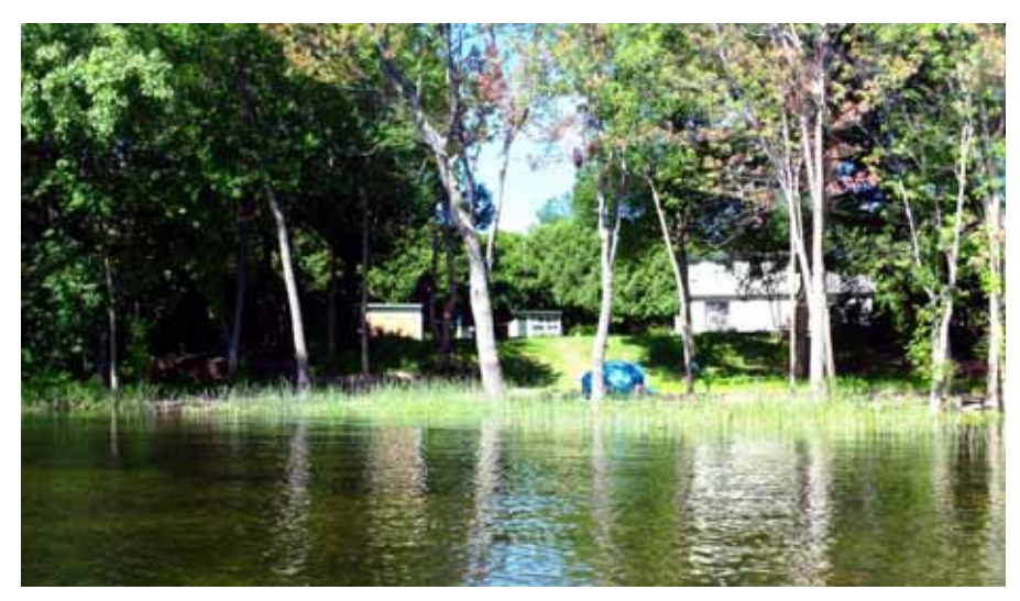
The trees in the foreground of this photo provide protection from wave action and lessen erosion along the lakeshore.

Natural shoreline vegetation also offers clear benefits to lake ecosystems. Bass preferentially build nests along undeveloped shorelines. Bass reach the legal size for fishing faster in undeveloped lakes. Trout get most of their food from terrestrial insects in undeveloped lakes, but at most two percent in lakes with extensive shoreline development. As a result, trout in undeveloped lakes ingest 50 percent more energy daily than those in developed lakes. Development decreases macroinvertebrate diversity in lakes leading to less and fewer types of food for fish. Cleared shorelines contribute 18 times more sediment, five times more runoff and seven times more phosphorus to the lake than those where the shoreline is wooded.