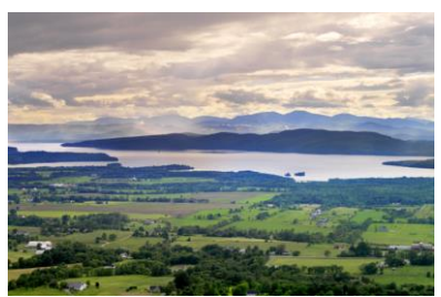
View from Mt. Philo